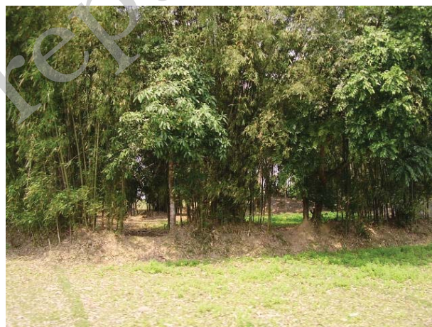
Fig. 4.3: Bamboo plantation in North-east

Karnataka are some of the important plantation crops grown in these states. Since the production is mainly for market, a well-developed network of transport and communication connecting the plantation areas, processing industries and markets plays an important role in the development of plantations.