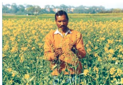
Fig. 4.9: Groundnut, sunflower and mustard are ready to be harvested in the field