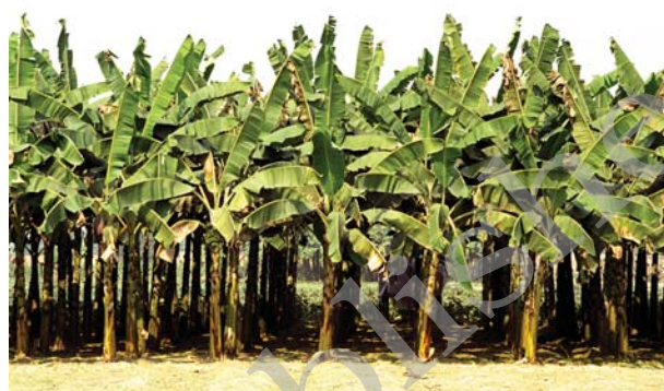
Fig. 4.2: Banana plantation in Southern part of India

In India, tea, coffee, rubber, sugarcane, banana, etc.. are important plantation crops. Tea in Assam and North Bengal coffee in