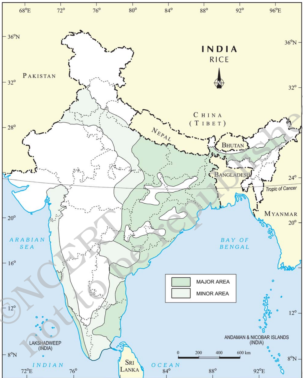
India: Distribution of Rice