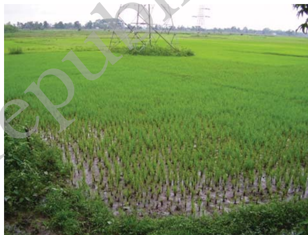
Fig. 4.4 (a): Rice Cultivation

Rice is grown in the plains of north and north-eastern India, coastal areas and the deltaic regions. Development of dense network