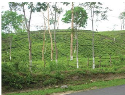
Fig. 4.10: Tea Cultivation

Coffee: India produces about four per cent of the world's coffee production. Indian coffee is known in the world for its good quality. The Arabica variety initially brought from Yemen is produced in the country. This variety is in great demand all over the world. Initially its cultivation was introduced on the Baba Budan Hills and