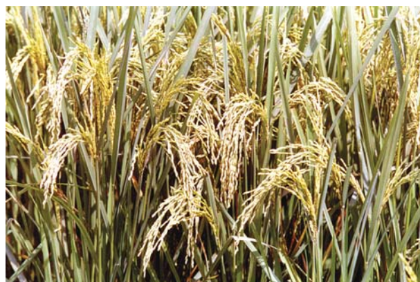
Fig. 4.4 (b): Rice is ready to be harvested in the field