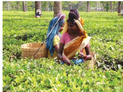
Fig. 4.11: Tea-leaves Harvesting

India is a producer of tropical as well as temperate fruits. Mangoes of Maharashtra, Andhra Pradesh, Uttar Pradesh and West Bengal, oranges of Nagpur and Cherrapunjee (Meghalaya), bananas of Kerala, Mizoram, Maharashtra and Tamil Nadu, lichi and guava of Uttar Pradesh and Bihar, pineapples of Meghalaya, grapes of Andhra Pradesh and Maharashtra, apples, pears, apricots and walnuts of Jammu and Kashmir and Himachal Pradesh are in great demand the world over.