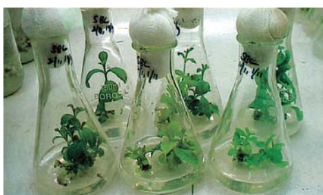
Fig. 4.17: Tissue culture of teak clones

Under globalisation, particularly after 1990, the farmers in India have been exposed to new challenges. Despite being an important producer of rice, cotton, rubber, tea, coffee, jute and spices our agricultural products are not able to compete with the developed countries because of the highly subsidised agriculture in those countries.