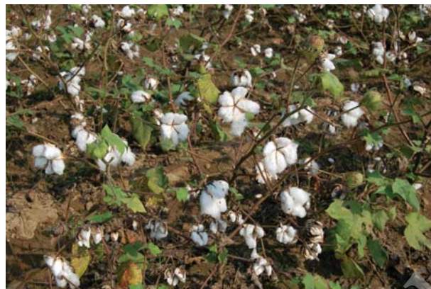
Fig. 4.15: Cotton Cultivation

Cotton: India is believed to be the original home of the cotton plant. Cotton is one of the main raw materials for cotton textile industry. India is the third-largest producer of cotton in the world. Cotton grows well in drier parts of the black cotton soil of the Deccan plateau. It requires high temperature, light rainfall or