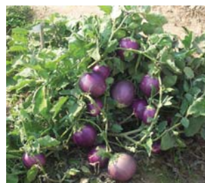
Fig. 4.13: Cultivation of vegetables – peas, cauliflower, tomato and brinjal