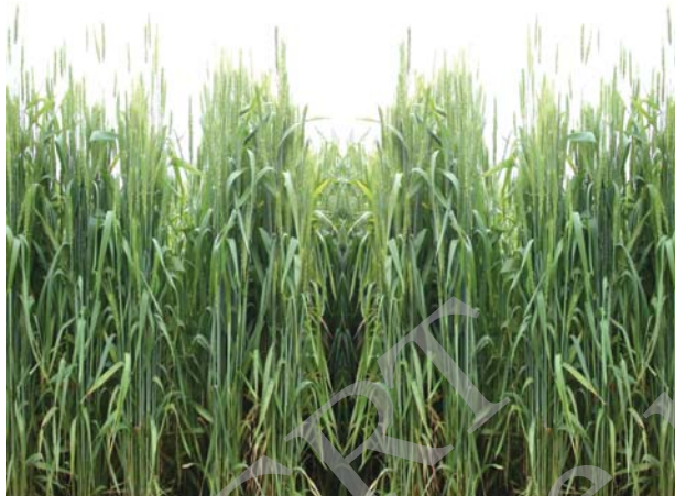
Fig. 4.5: Wheat Cultivation

Wheat: This is the second most important cereal crop. It is the main food crop, in north and north-western part of the country. This rabi crop requires a cool growing season and a bright sunshine at the time of ripening. It requires 50 to 75 cm of annual rainfall evenly-distributed over the growing season. There are two important wheat-growing zones in the country – the Ganga-Satluj plains in the north-west and black soil region of the Deccan. The major wheat-producing states are Punjab, Haryana, Uttar Pradesh, Bihar, Rajasthan and parts of Madhya Pradesh.