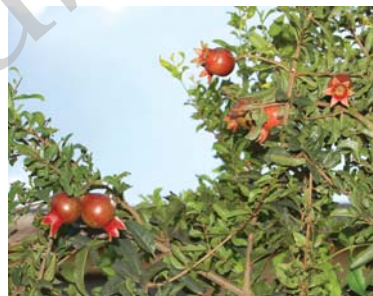
Fig. 4.12: Apricots, apple and pomegranate

even today its cultivation is confined to the Nilgiri in Karnataka, Kerala and Tamil Nadu.