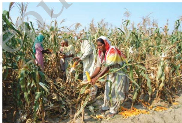
Fig. 4.7: Maize Cultivation

Maize: It is a crop which is used both as food and fodder. It is a kharif crop which requires