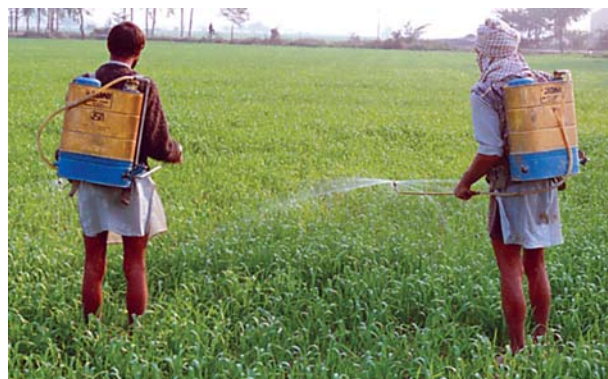
Fig. 4.18: Problems associated with heavy pesticide use are widely recognised in developed and developing countries

Can you name any gene modified seed used vastly in India?