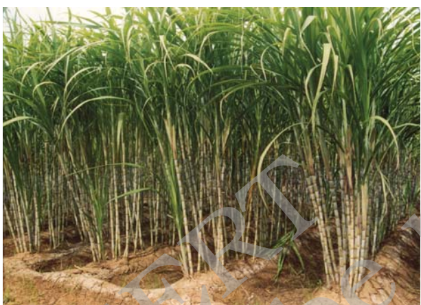
Fig. 4.8: Sugarcane Cultivation

Sugarcane: It is a tropical as well as a subtropical crop. It grows well in hot and humid climate with a temperature of 21°C to 27°C and an annual rainfall between 75cm.