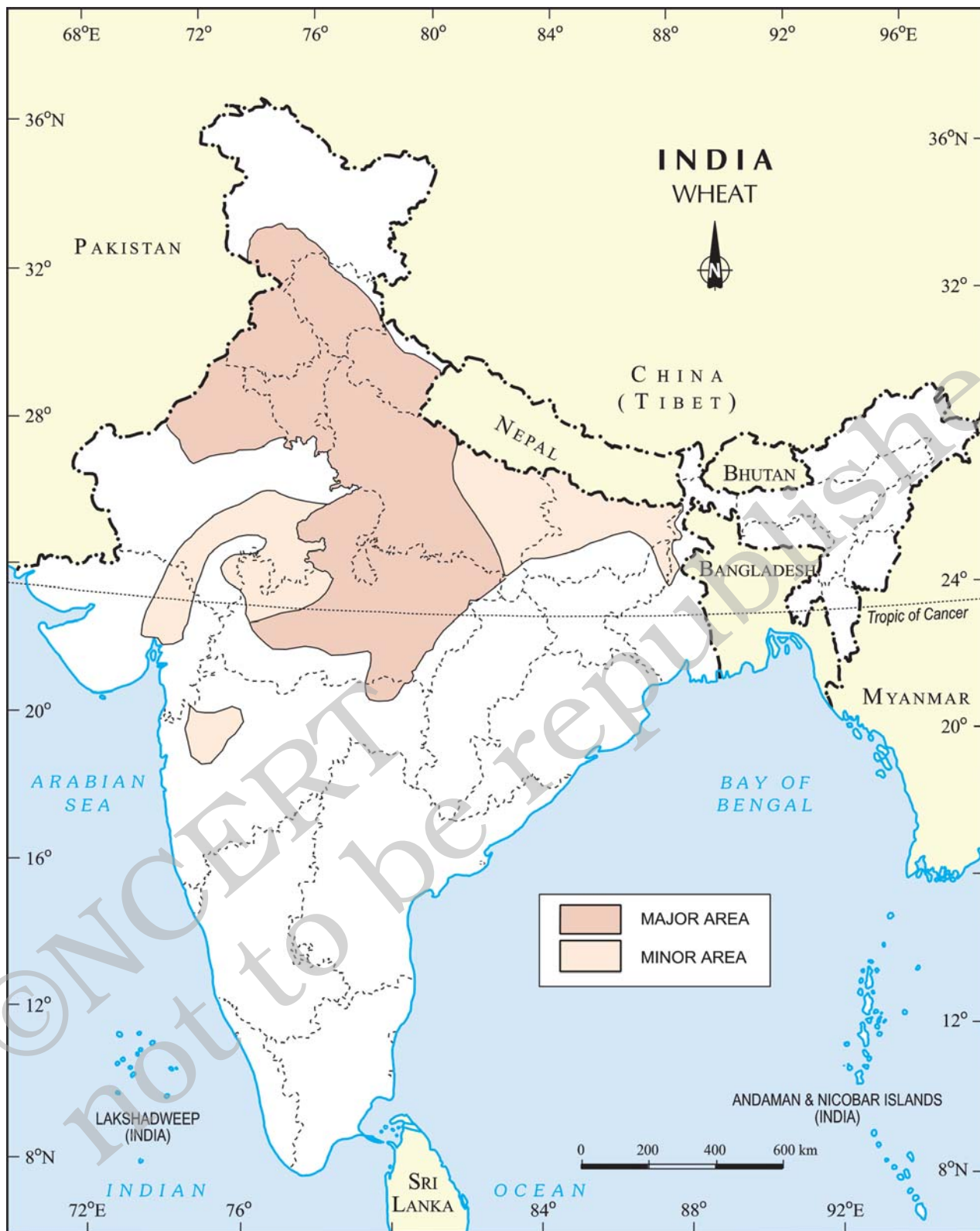
India: Distribution of Wheat