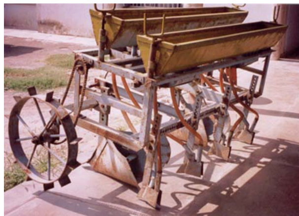
Fig. 4.16: Modern technological equipments used in agriculture

consolidation of holdings, cooperation and abolition of zamindari, etc. were given priority to bring about institutional reforms in the country after Independence. 'Land reform' was the main focus of our First Five Year Plan. The right of inheritance had already led to fragmentation of land holdings necessitating consolidation of holdings.