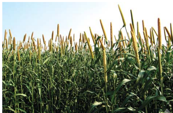
Fig. 4.6: Bajra Cultivation

Bajra grows well on sandy soils and shallow black soil. Rajasthan is the largest producer of bajra followed by Uttar Pradesh, Maharashtra, Gujarat and Haryana. Ragi is a crop of dry