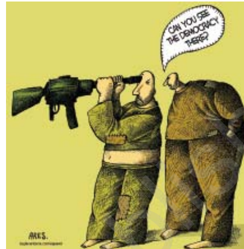
Seeing the democracy