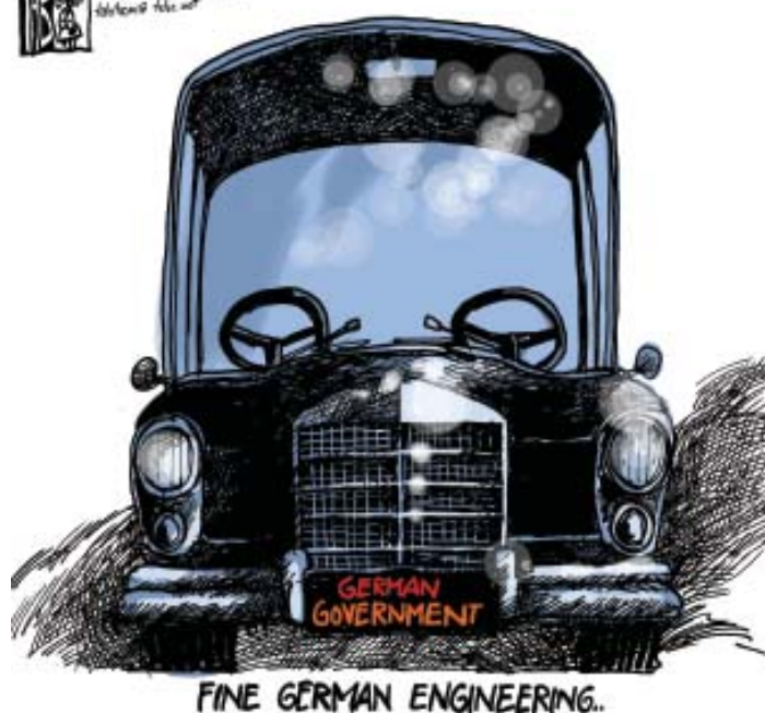
© Tab - The Calgary Sun, Cagle Cartoons Inc.

The cartoon at the left refers to the problems of running Germany's grand coalition government that includes the two major parties of the country, namely the Christian Democratic Union and the Social Democratic Party. The two parties are historically rivals to each other. They had to form a coalition government because neither of them got clear majority of seats on their own in the 2005 elections. They take divergent positions on several policy matters, but still jointly run the government.