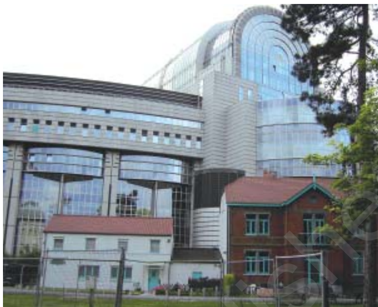
European Union Parliament in Belgium

You might find the Belgian model very complicated. It indeed is very complicated, even for people living in Belgium. But these arrangements have worked well so far. They helped to avoid civic strife between the two major communities and a possible division of the country on linguistic lines. When many countries of Europe came together to form the European