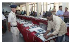
(/kolkata/news-182574) 'Panchayat Members Can Contest Polls Without Resigning' (/kolkata/news-182574)