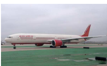
(/kolkata/news-182546) Zoom Air To Start Operations On 3 Routes From Feb 12 (/kolkata/news-182546)