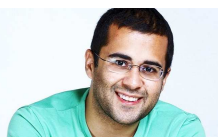
(/kolkata/news-182585) Mamata Is 'mini Modi': Chetan Bhagat (/kolkata/news-182585)