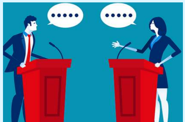
Many online competitions- Extempore, debate etc.