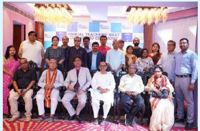
UTKARSH: Annual Teacher's Meet