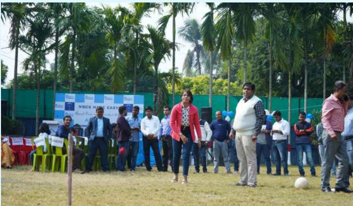
Yearly Picnic at Baruipur in 2021