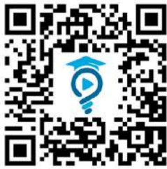
COLLEGE STREET LOCATION