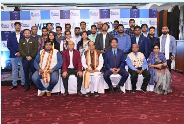
UTTARAN: Annual Convocation 2021